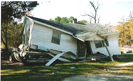
The roof and walls of this home have been compromised and it is off its foundation.