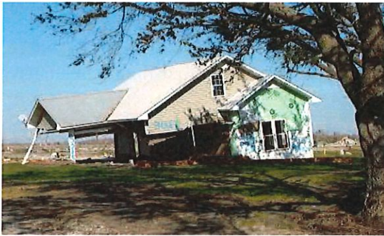
The foundation and two or more walls of this residence have failed.