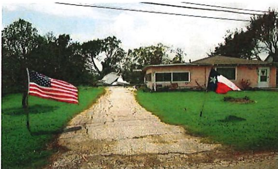
Only an outbuilding has sustained damage.