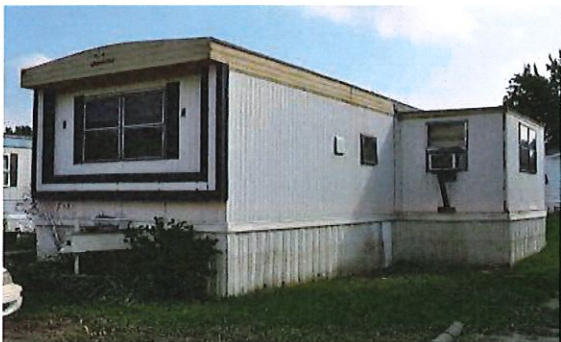
The visible water line is below the floor system.