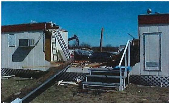
The manufactured home is missing the roof and at least two walls.