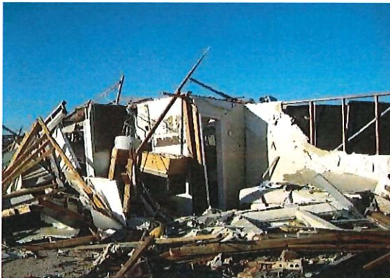
This residence has collapsed.