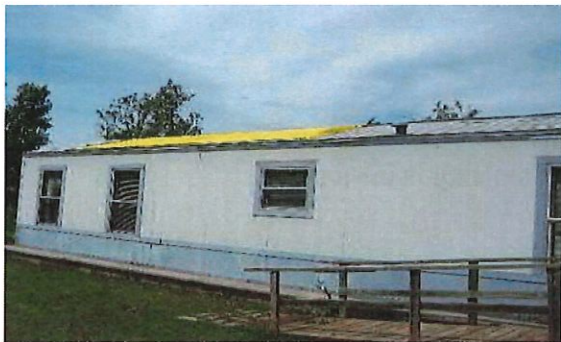
A portion of the roof has been damaged.