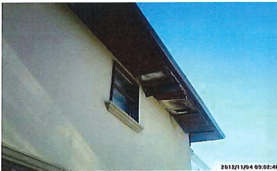
Damage to this soffit represents nonstructural damage to the roof.