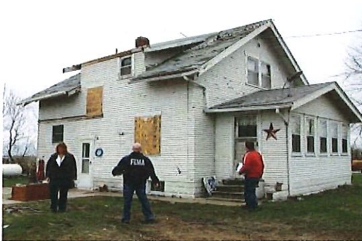
This residence has nonstructural damage to the roof and broken windows.