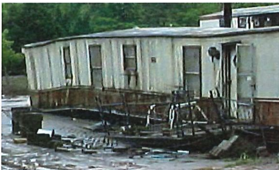
The frame of the manufactured home has been bent.