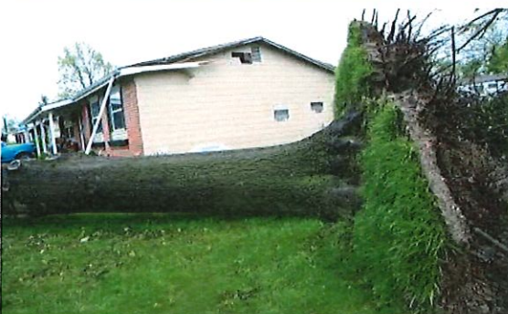
The residence has gutter and roof damage. The tree does not impact the damage level of the home.