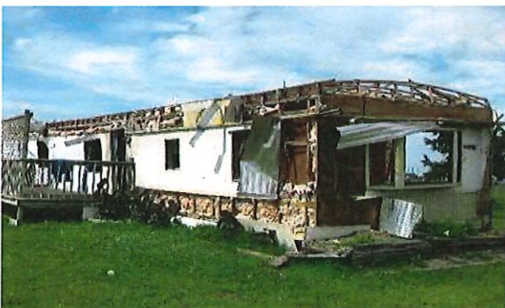
This manufactured home is missing the roof covering, and at least one wall has been compromised.