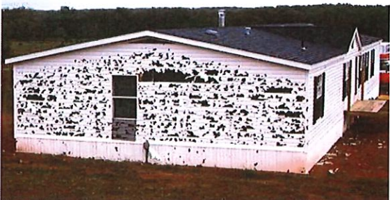
Nonstructural components of one wall have sustained damage.